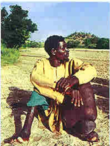
Lymphatic filariasis is caused by a parasitic worm, which is carried by 120