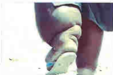
Video: A Disease's Hidden Agony